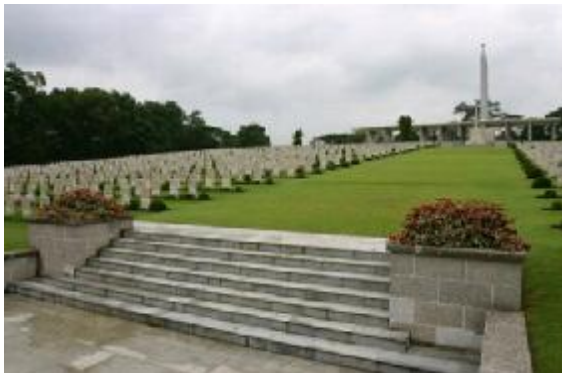
Kranji Memorial Park

Singaporeans are well known for their nationalism (or not?)